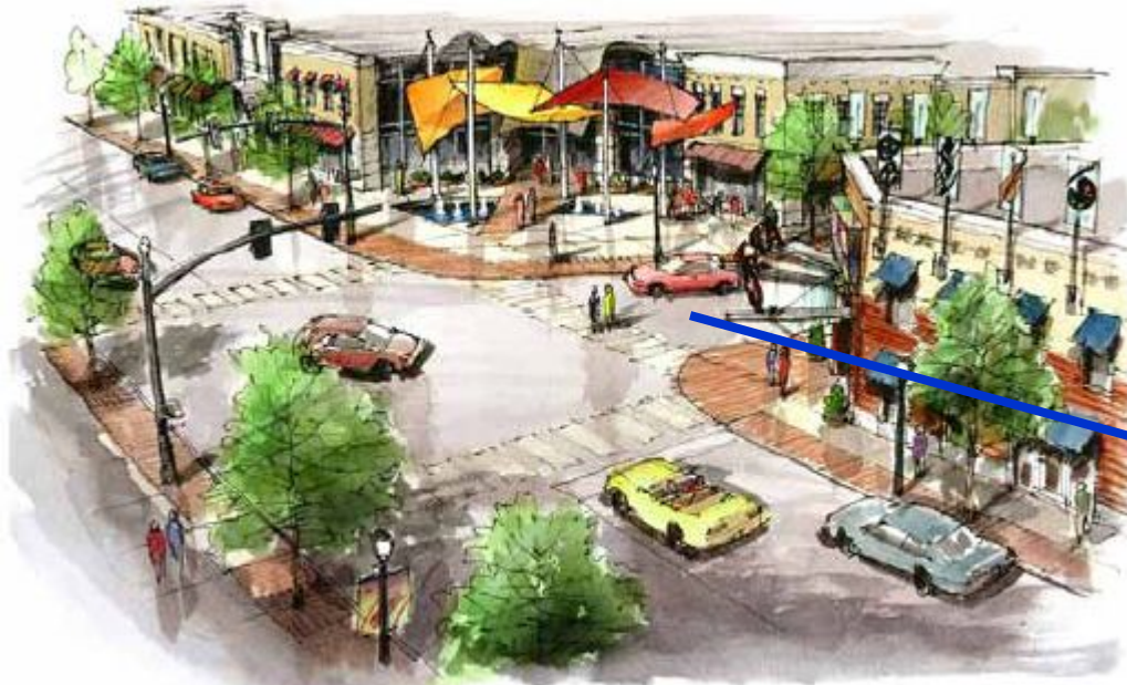
Kennedy & Montgomery Streetscape Concept

Nice plan view (right) and vignette (above) that show what this designer wants to do with the beginning of Kennedy Ave to give more "announcement" to its entrance (notice what a large statement small wispy yellow and red banners make!).