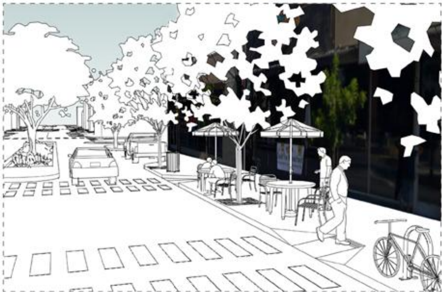
Widened sidewalk at Broadway & Olive, showing a typical sidewalk cafe