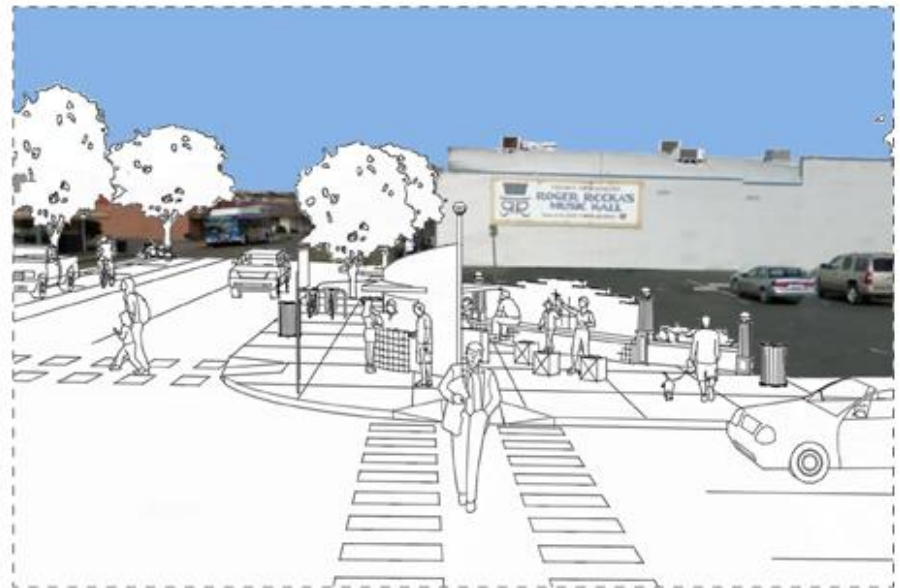
Plaza at the northeast corner of Olive & Wishon, showing a kiosk, sitting blocks & wall, and street furniture