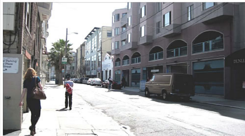
Figure E-2.2x: Existing Site-Specific Streetscape Improvement Project at Hoff and 16th Streets- Looking South.